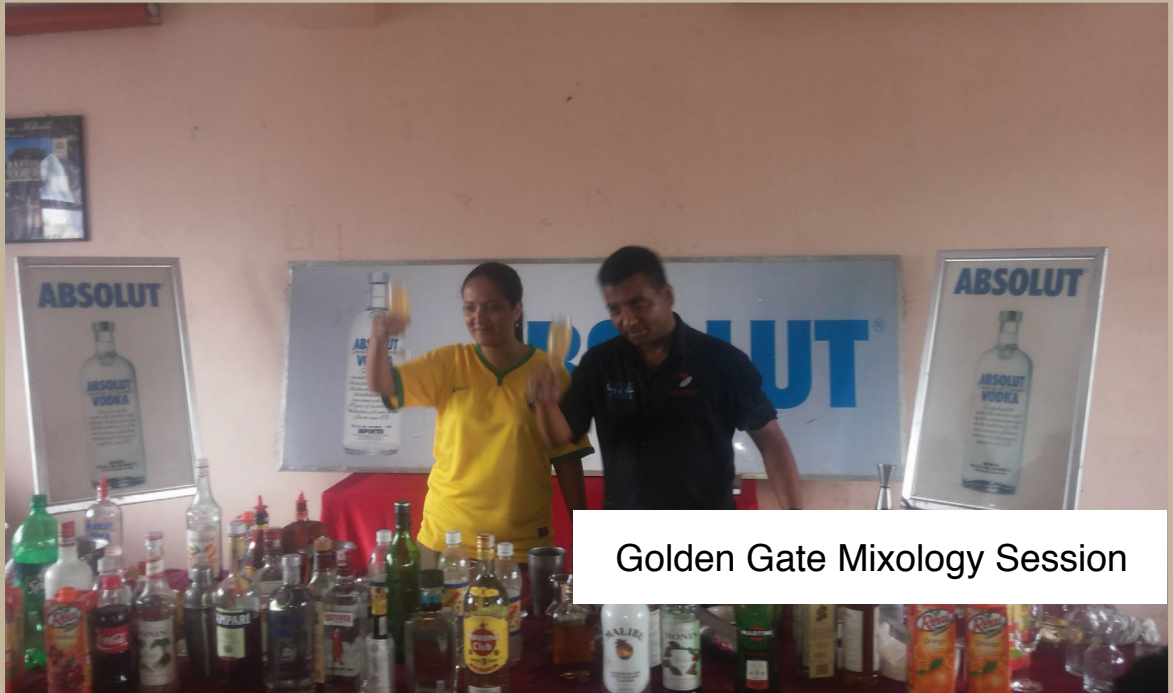
Golden Gate Mixology Session