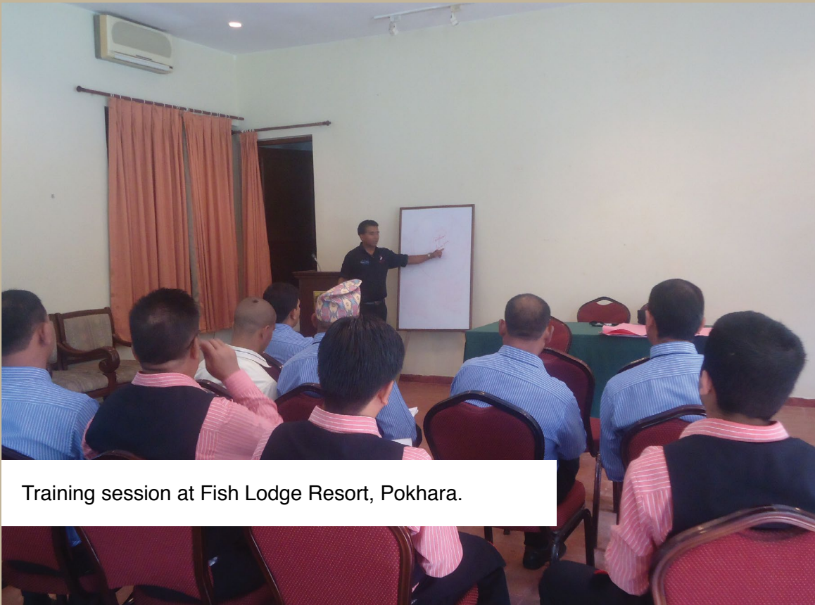
Training session at Fish Lodge Resort, Pokhara.