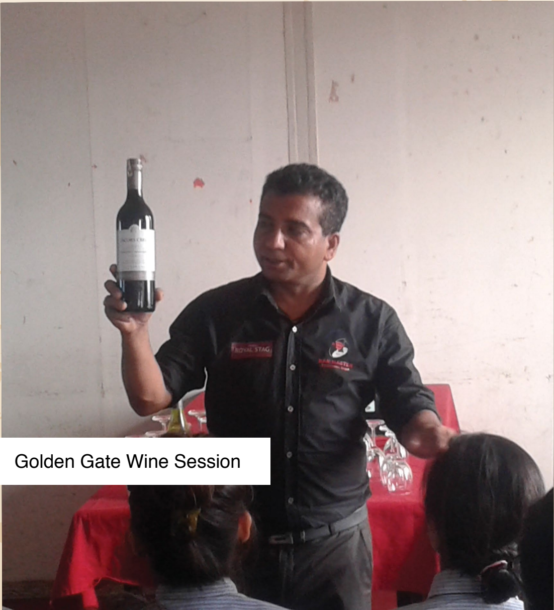
Golden Gate Wine Session