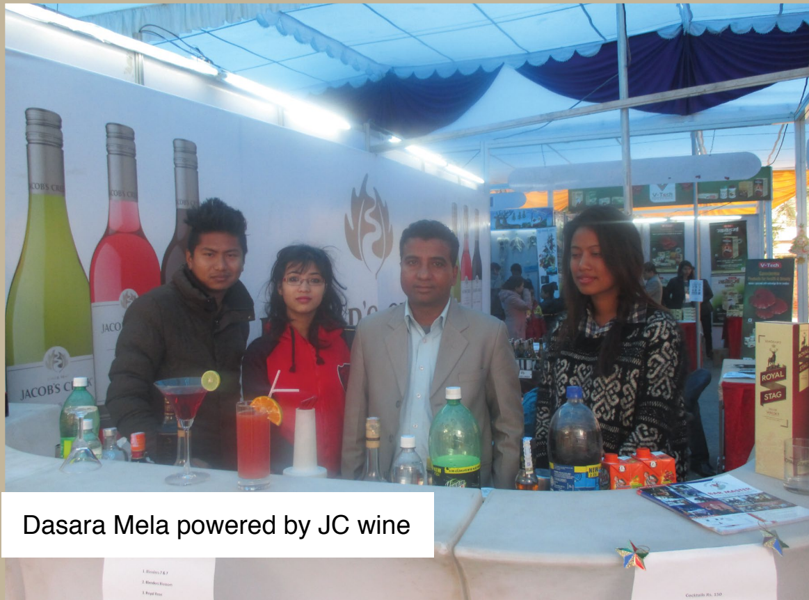
Dasara Mela powered by JC wine