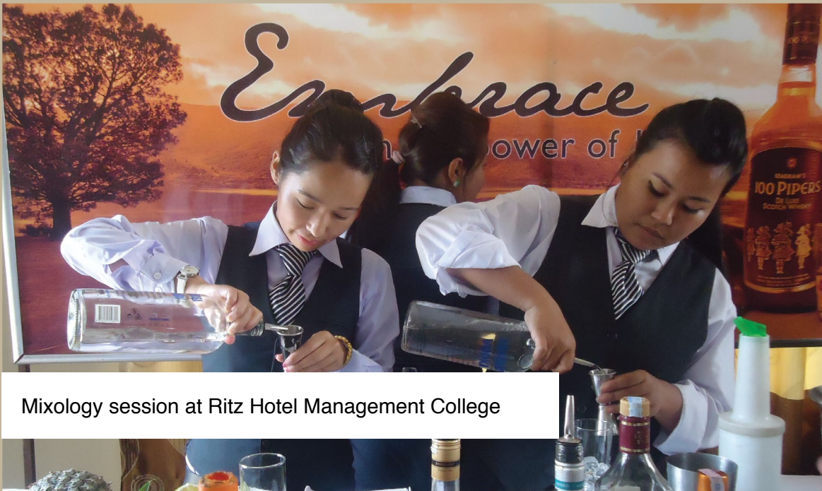
Mixology session at Ritz Hotel Management College