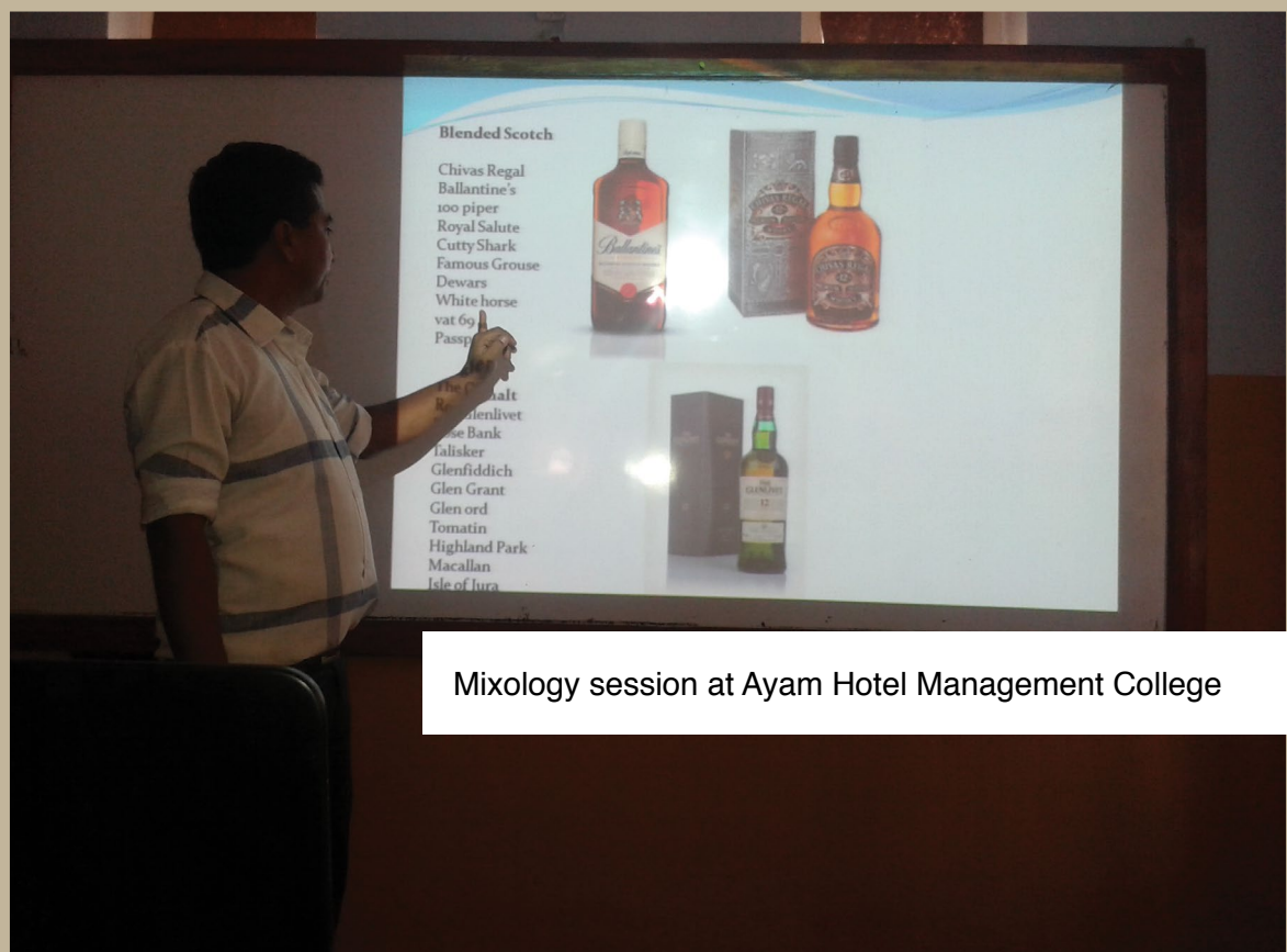
Mixology session at Ayam Hotel Management College